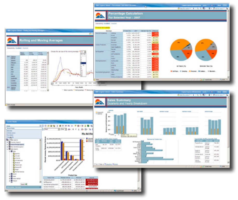
An intuitive, easy-to-use interface provides complete, self-service access to reports and analysis.

The first step toward initiating or expanding your planning strategy is to enhance the spreadsheet processes while eliminating the inherent risks in using spreadsheets. IBM Cognos Express Xcelerator extends and transforms the familiar Excel front-end