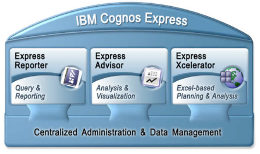
IBM Cognos Express offers a complete, integrated solution for a midsize company's reporting, analysis and planning needs.

For organizations that are beginning to embark or expand on a BI and planning strategy, IBM Cognos Express includes everything needed to get started right away. It offers powerful yet easy-to-use capabilities for both novices and advanced users to encourage broad adoption throughout a company.